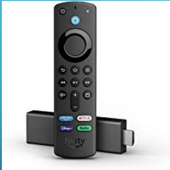
FIRE TV STICK $25 - $40