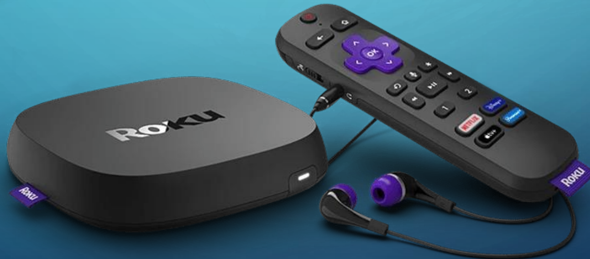
ULTRA $100 (4K + DOLBY ATMOS)