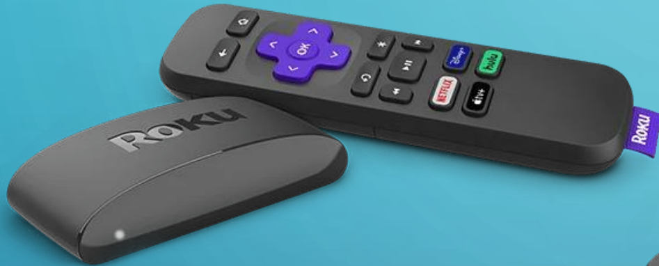
EXPRESS $25 (HD)